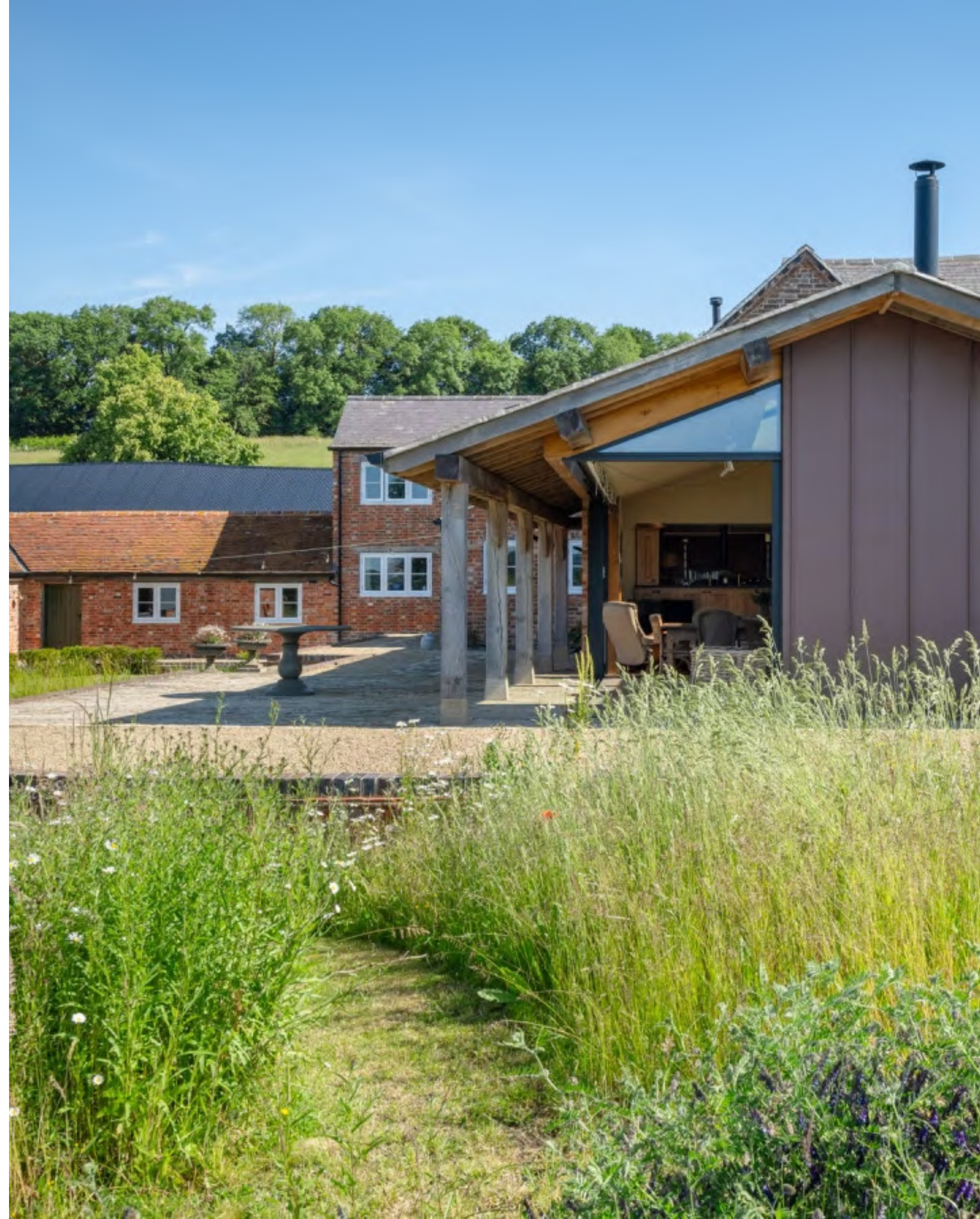
Farmhouse, remodel and addition, Northamptonshire

We are committed to high quality design and leading project teams in defining and delivering on project programmes.