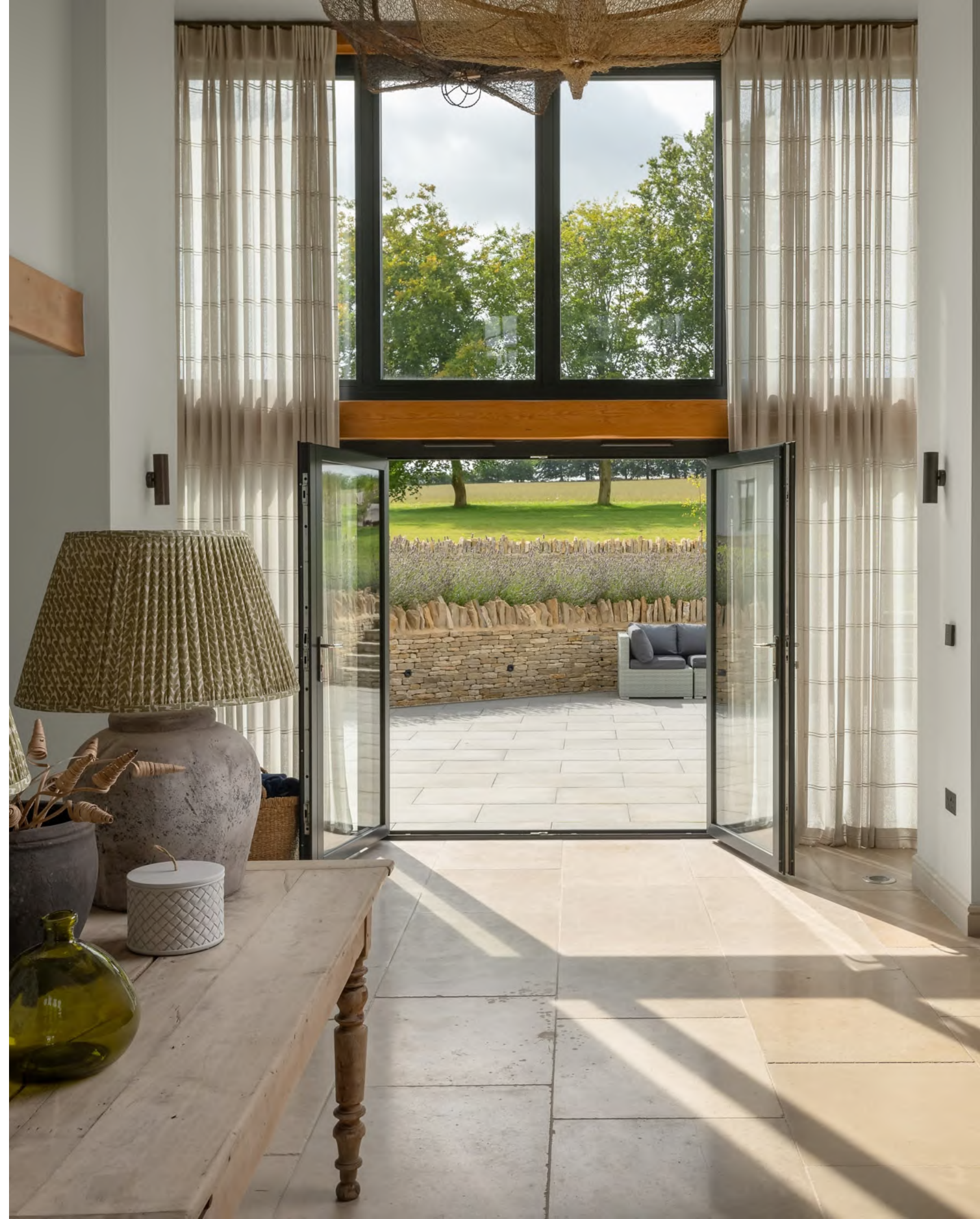
Barn conversion to grand AirB&B, The Cotswolds

We continuously look to grow and take on larger design projects that align with our vision.