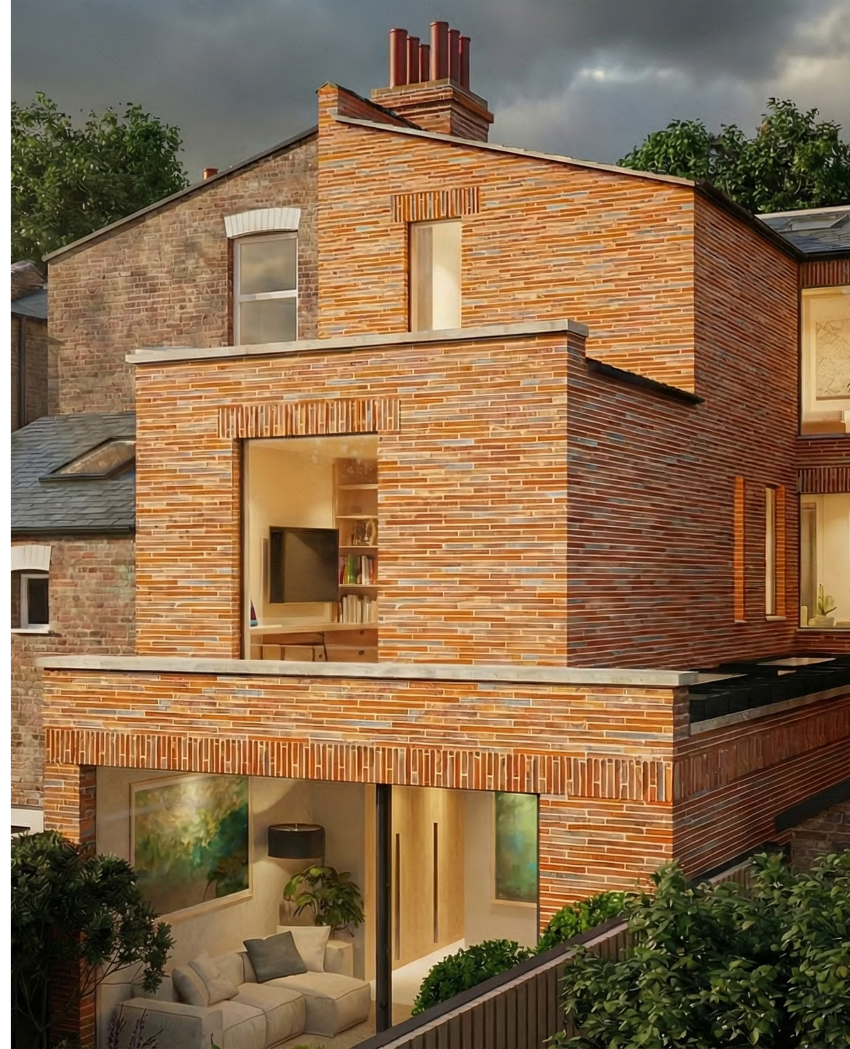
Full house renovation and rear addition, Fulham, London

We like to think of framing the context with a picture window over looking roof tops, city scapes or a wisteria clad brick wall.