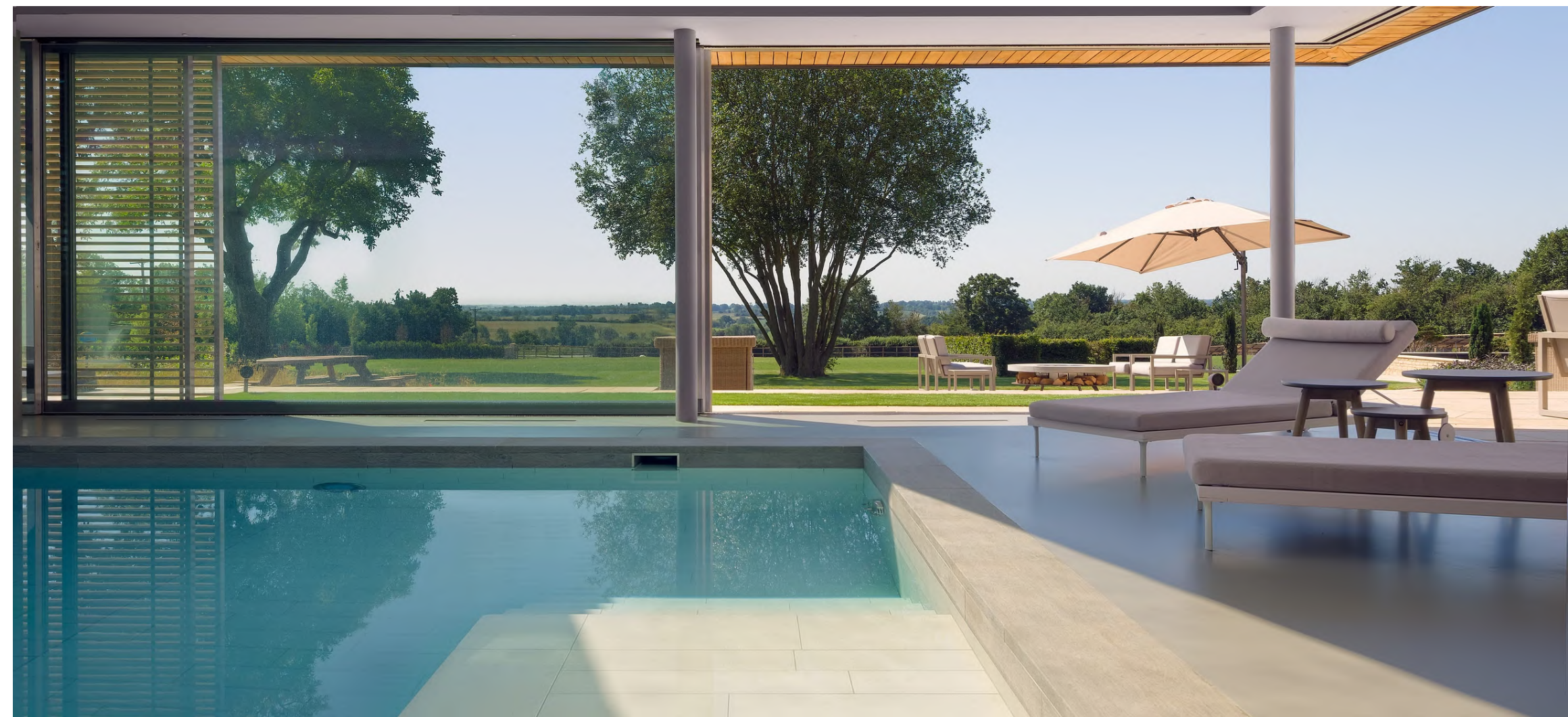
TOP Farmhouse remodel, refurbishment with kitchen, living addition, Northamptonshire