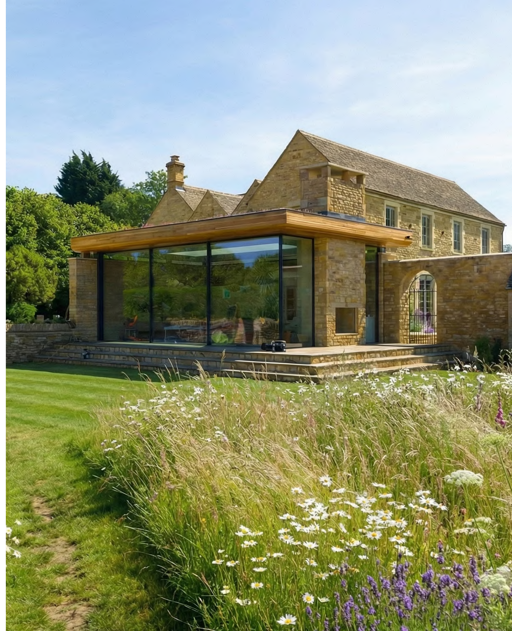
New build farmhouse with garden room, The Cotswolds

Our work is rooted in contemporary, purposeful design.